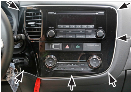
2. Unclip OEM panel (see arrows)