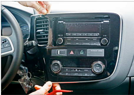
3. Remove OEM panel carefully