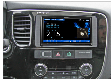
7. Connect all required circuit points

Attach mounting brackets to Double DIN head unit