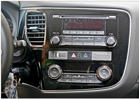
1. Mitsubishi Outlander OEM dashboard