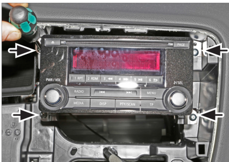
4. Remove 4 screws of OEM head unit (see arrows)