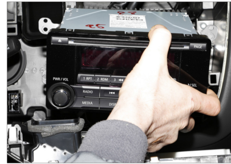
5. Remove OEM head unit