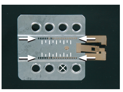
The position of the copper coloured holder can be adjusted to your needs for perfect fit. (see sample)